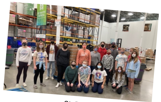
St. Paul youth serving at the Northern Illinois Food Bank