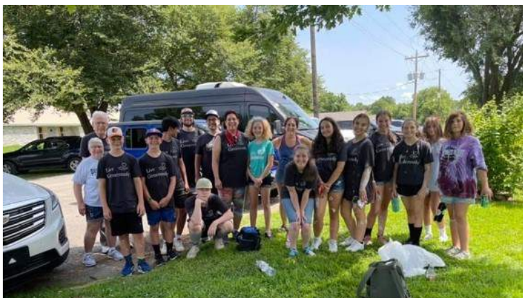
Middle School youth at the end of a long hot day of painting, clean up and weeding at the Indian Mission and Eben Ezer Lutheran in Oaks, Oklahoma.

Youth Trips are always an exciting experience. I love going to new places to meet new people and serve alongside them. It's not all fun and games. Sixteen hours of driving takes its toll for sure, as does a long day of work in the hot sun at Oaks Indian Mission, but I wouldn't trade these experiences for anything. I find such joy in watching our youth wanting to serve (truly, they never want to "stand around" when we're at a worksite) and seeing relationships develop over the course of the week. The car rides get louder and louder too, with each day of comfort we find with each other. Although the excitement of the trips has passed, our opportunities to continue to serve and form relationships remain constant no matter where we are. I am thankful for this community and for our commitment to exploring new ways to serve and be served wherever we may be.