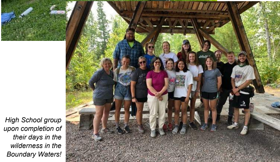
High School group upon completion of their days in the wilderness in the Boundary Waters!