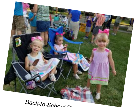
Back-to-School Blessing and ice cream!

To limit crowds a ticket ($6) is required for everyone over the age of 2 and can be purchased online on the Jonamac website to reserve your spot. Each family is responsible for purchasing their own tickets. Included are daytime corn maze, jumping pillow, animal barn petting zoo, Cider House tasting room, barnyard play area and wagon rides. ½ peck bags for U-Pick apples are an additional $15. Come join us for a day of family fun and fellowship!