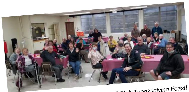
Giving Thanks: The Under 105 Club Thanksgiving Feast!

"Then you will call, and the Lord will answer; you will cry for help, and He will say: 'Here Am I'." — Isaiah 58:9