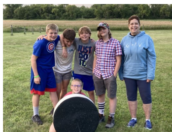
Our Middle School youth enjoying a week at LOMC.