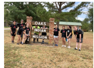
Our High School youth serving at the Oaks Indian Mission in Oklahoma.